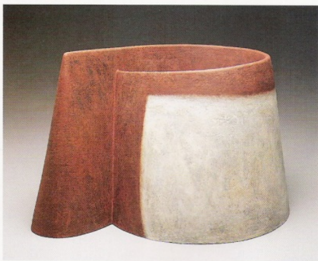
Slab-built stoneware vessel, 12 inches in height, brushed with oxides and slips.